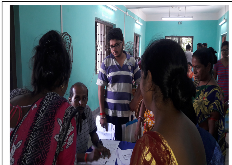
Registration Camp for NULM beneficiaries for SSY