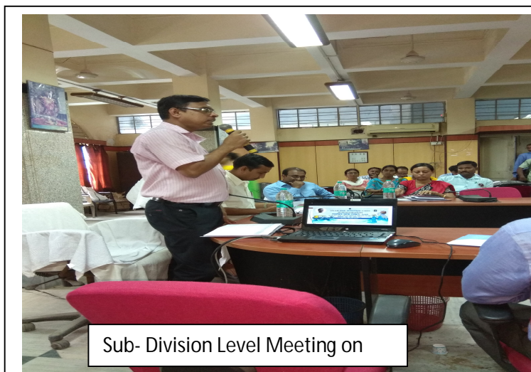
Sub- Division Level Meeting on

North Baracpore Municipality organized Municipal Level Workshop & awareness campaign cum registration camp on 18 th of July 2018 . In First Phase 21 members of the group enlisted their name . 18 th July was Declared as “Samajik Suraksha Dibos”.