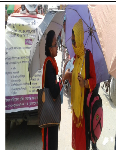
Campaign on CLC at Rajpur Sonarpur ULB